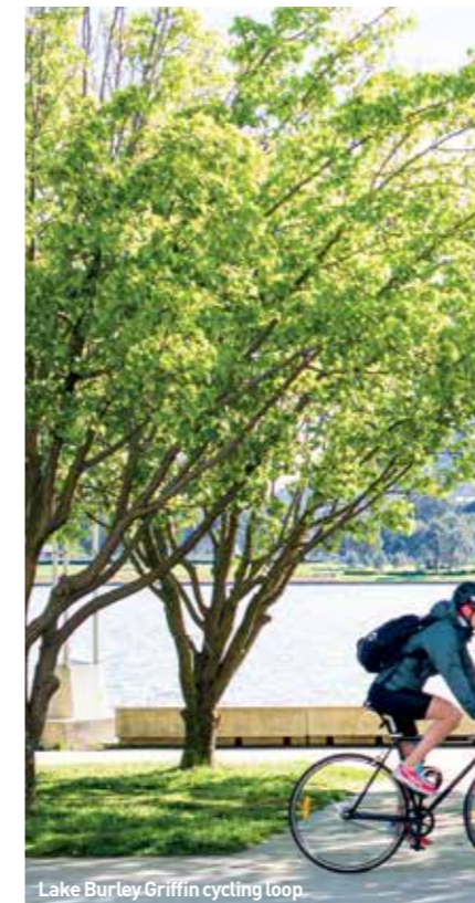
Lake Burley Griffin cycling loop.