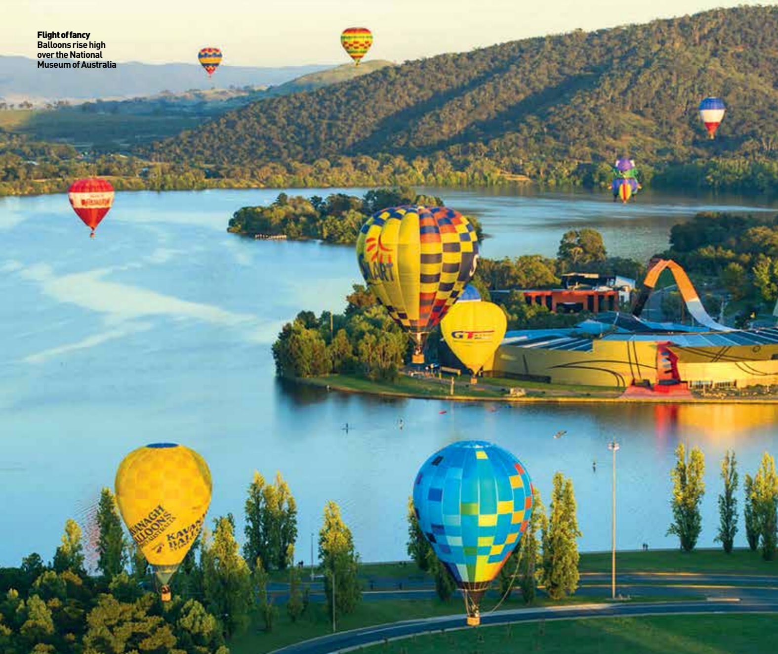
Flight of fancy Balloons rise high over the National Museum of Australia