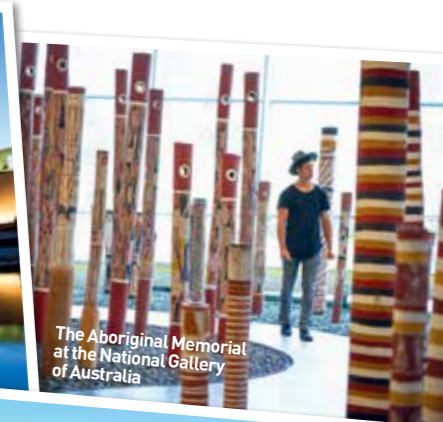
The Aboriginal Memorial at the National Gallery of Australia