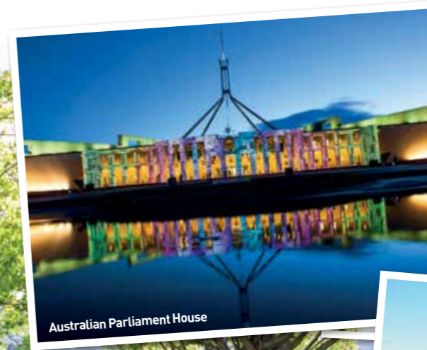
Australian Parliament House