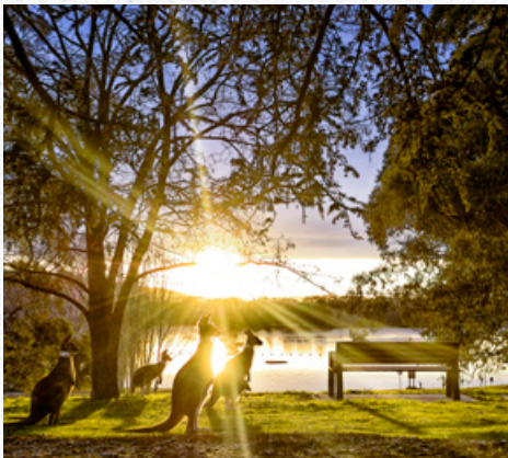
Weston Park, Lake Burley Griffin