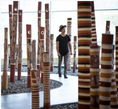
National Gallery of Australia