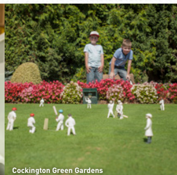
Cockington Green Gardens