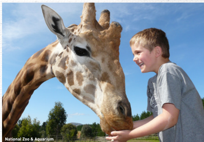
National Zoo & Aquarium