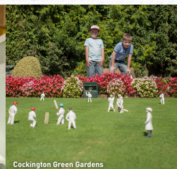
Cockington Green Gardens