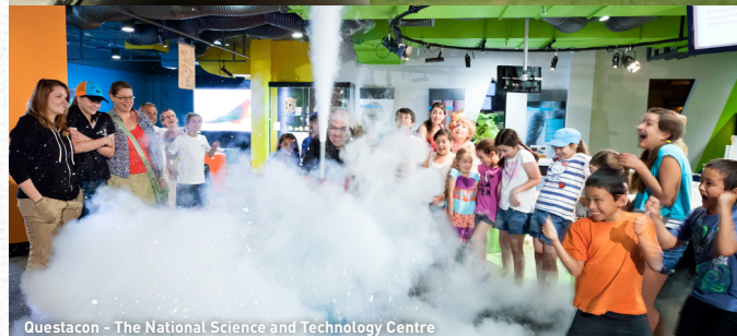
Questacon - The National Science and Technology Centre