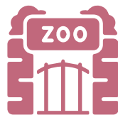
ZOOS, WILDLIFE PARKS, AQUARIUMS