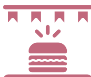
FOOD & DRINK FESTIVALS